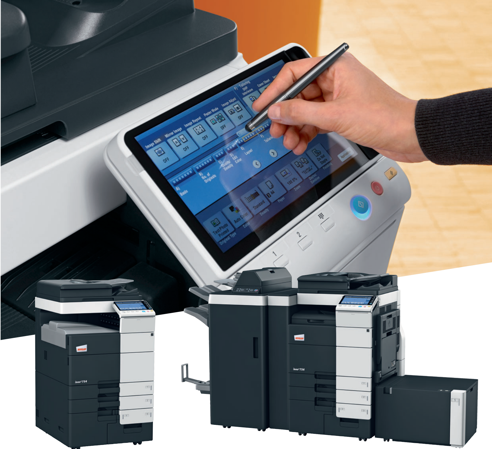
ineo+ 754 with output tray (OT-503)